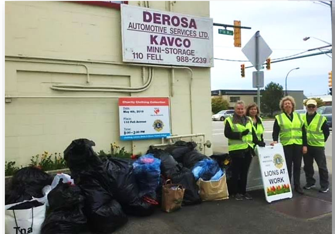
Lions collection of lightly used clothing for the homeless