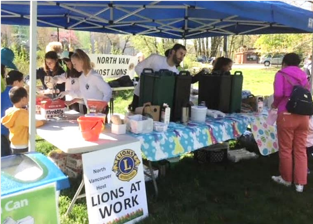
Concession stand at annual Lions Community Easter Egg Hunt