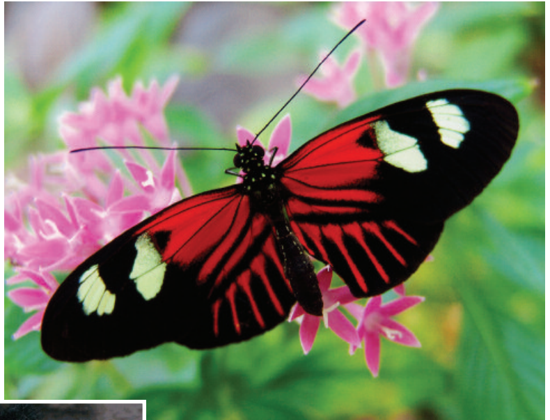
Best Special Theme Photo (A Passion for Our World) – Silent Flight by Penny Rummel.

2006 district convention. Their 33 club-level photos (matted by a local frame shop for free) were displayed and entered into a silent auction.