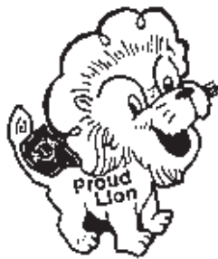
Proud Lion Vest Pin