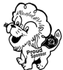
Proud Sponsor Vest Pin

A single vest pin is available for the Proud Lion. Because a Proud Sponsor might become involved with more than one Protege Lion there are eight (8) Proud Sponsor vest pins available following this sequence of member sponsorship: