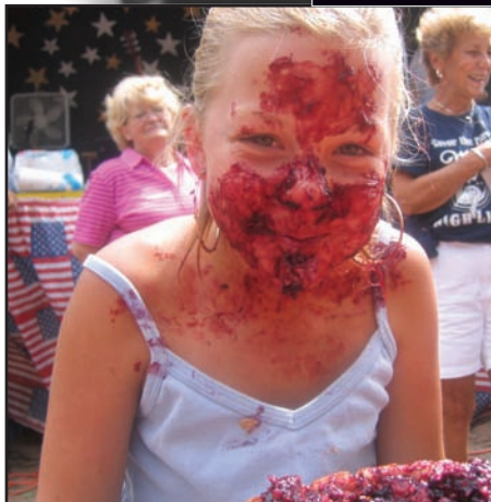
Get close to the subject, as a Lion in Iron River, Wisconsin, did.

Move close to your subject. The number one shortcoming with photos comes from failure to observe this rule. Distance equates to disaster. No image is more powerful than the human face, so in photographing people closer is better.