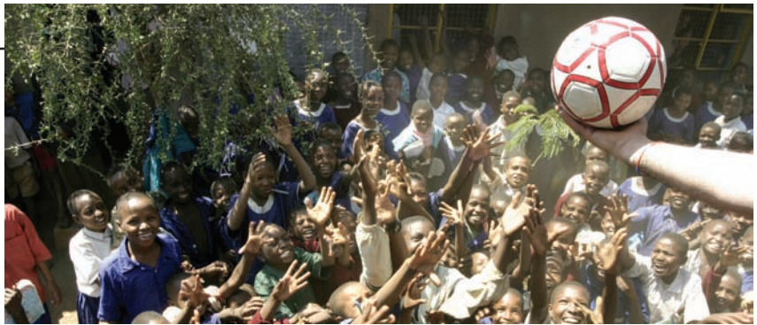
You don't need a caption to tell you these impoverished children in Africa are happy to receive the gift of a soccer ball.

A picture is worth a thousand words, right? That's because a good photo tells a story. Someone is doing something and the beholder of the photo can immediately discern what that is.