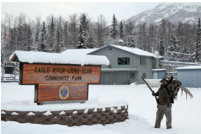
This Alaskan Lion agreed to don his outdoorsman gear to emphasize the rugged setting of his clubhouse.