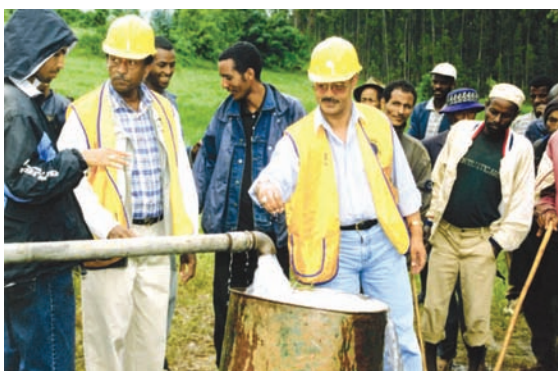
The pump, complete with flowing water, is a nice "prop."

Any unusual item, whether its distinctiveness is because of size, shape, color or whatnot, enhances visual appeal.