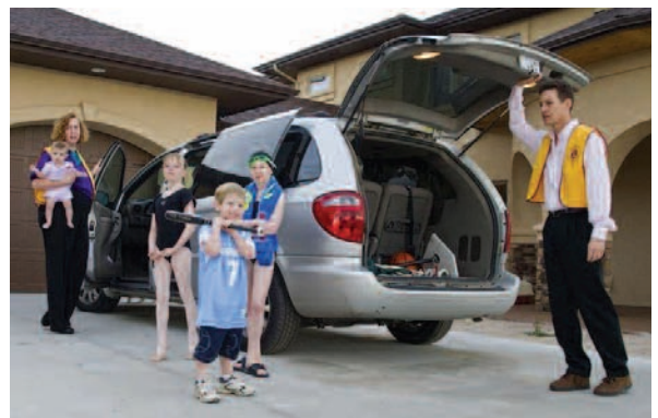
This photo accompanied a story on how busy Lions balance family with service. A professional shot it, but amateurs can take to heart the need to conceptualize a photo beforehand.