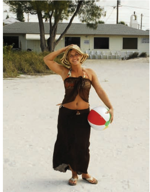
Lions in Florida enjoy a clubhouse on a beach, as this photo attests.